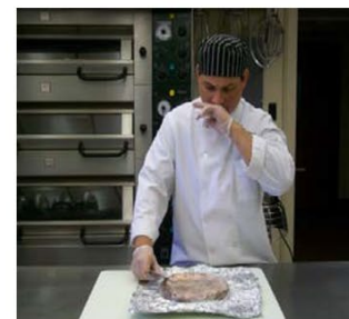
After coughing or sneezing