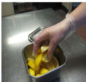
When handling lemons or tomatoes