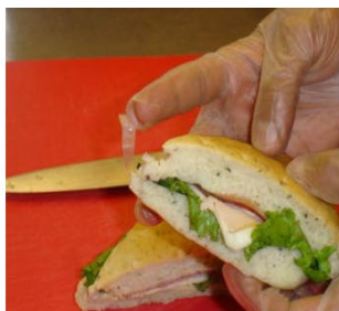
If gloves are ripped or torn