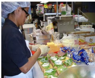
After every four hours of working on the same task