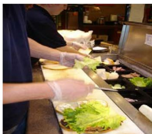
Before handling different types of foods