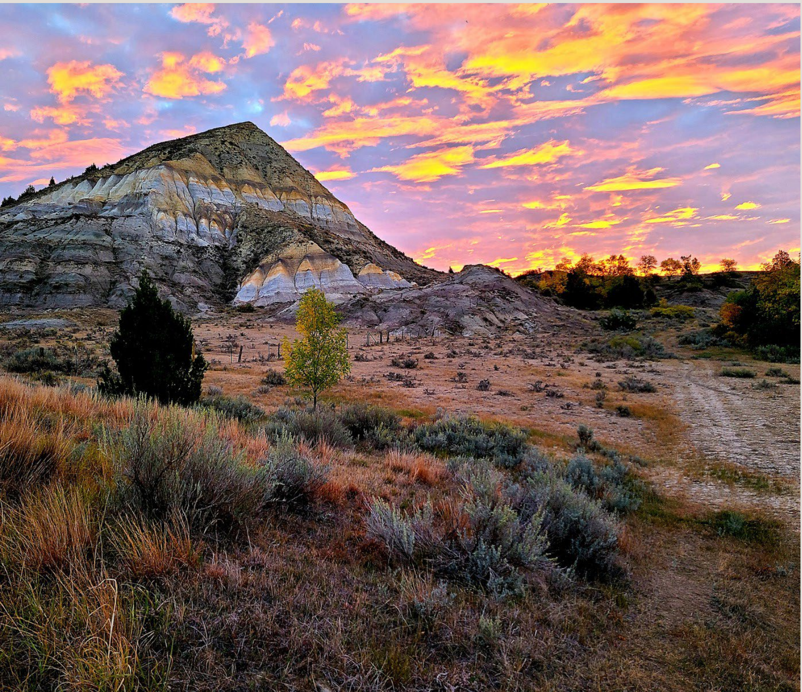
Sunrise, Little Missouri National Grassland